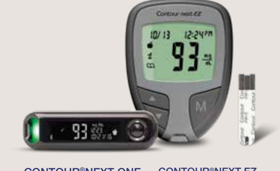
CONTOUR®NEXT ONE CONTOUR®NEXT EZ Blood Glucose Meter

Based on the recommendation of your HCP, testing your blood sugar at different times of the day can be beneficial to managing your diabetes. Testing tells you if your blood sugar is too high or too low. Testing can help you understand how food, exercise, or your medicines work and how these things affect your blood sugar.<sup>5</sup> For example, if you test your blood sugar before and then 2 hours after the start of a meal, you can see the effect of that meal on your blood